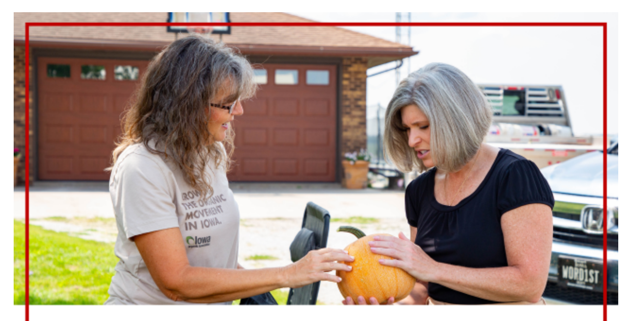
Ernst Celebrates Women in Agriculture

on our great rural traditions all across our state. Read more here.